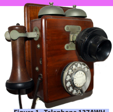
Figure 1 - Telephone 137AWH

In 1963, I was a fifth-year technician-in-training taking my turn on a six-month roster as one of two area technicians in the Wollongong Exchange District. I was sent to investigate a fault report at a North Wollongong residence, it turned out the 1930s bungalow was being renovated and to my surprise the telephone that was reported faulty was a 137AWH (an auto wall handset with timber case, Bakelite mouthpiece with inset transmitter and Bell receiver). It was covered in paint and in a poor state.