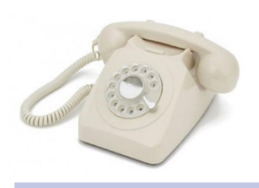
Figure 2 - Colorfone 800 Series

The subscriber had heard about the PMG's new Colorfones (800 series) that had been launched the year before and was very keen to match her new decor with a white telephone. Before the 800 series telephones became available, you could have any colour you liked as long as it was Bakelite black (although I did see a white 300 series telephone handset once – imported from England I believe).